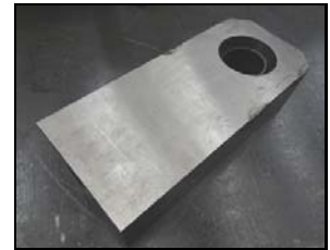
Mounting Step 290