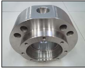
Head Cylinder Step 290