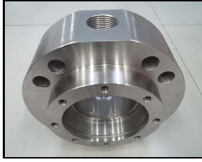
Head Cylinder Step 125