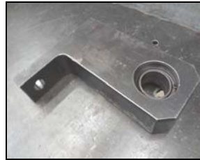
Mounting Step 125