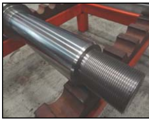
Rod Step 125