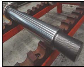
Rod Step 290