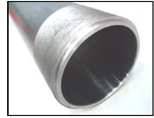
Tube Cylinder Step 290