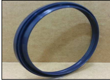
ITEM ; A