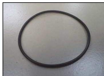
ITEM ; J