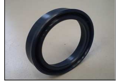
ITEM ; C