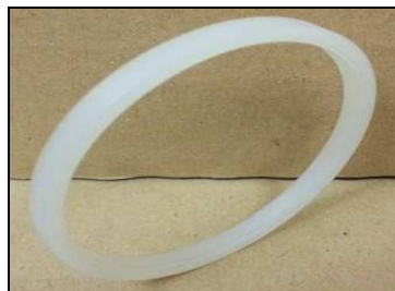
ITEM ; E