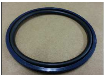
ITEM ; G