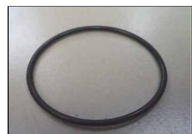
ITEM ; I