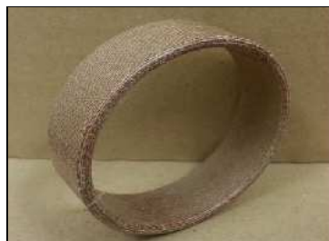
ITEM ; H