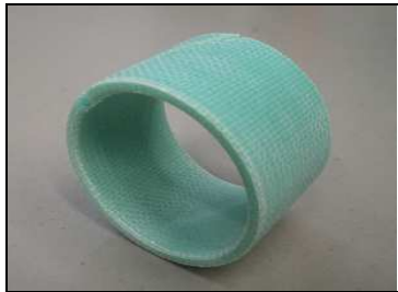
ITEM ; D