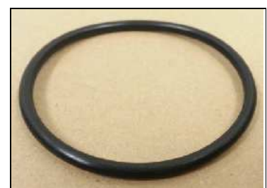
ITEM ; F