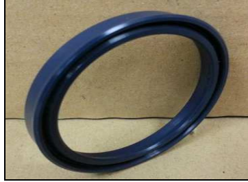
ITEM ; B