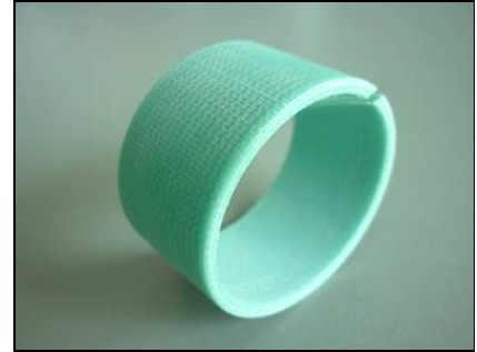
ITEM ; C