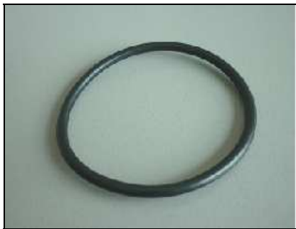
ITEM ; D