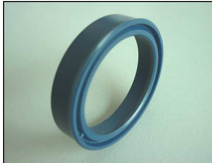
ITEM ; B