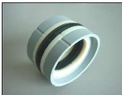
ITEM ; E