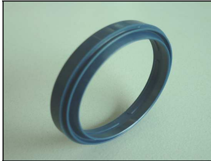
ITEM ; A